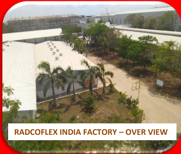
RADCOFLEX INDIA FACTORY – OVER VIEW